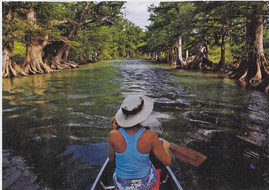
Guadalupe River run: Recreation on the river includes rafting, tubing, and paddling a canoe.