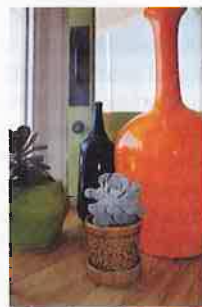
Texas time-outs: Shopping at chic boutique Root on Main Street in Fredericksburg for home accessories (left), walking along the lavender fields at family-owned Becker Vineyards (below), and petting the friendly burros at Juniper Hills Farm (far left).