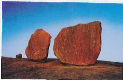
The sun sets on a pair of granite monoliths at Enchanted Rock. Before leaving Austin, try the Texas two-step at the Broken Spoke (right).

features large black granite stones and green mossy mounds designed to represent islands in the Pacific.